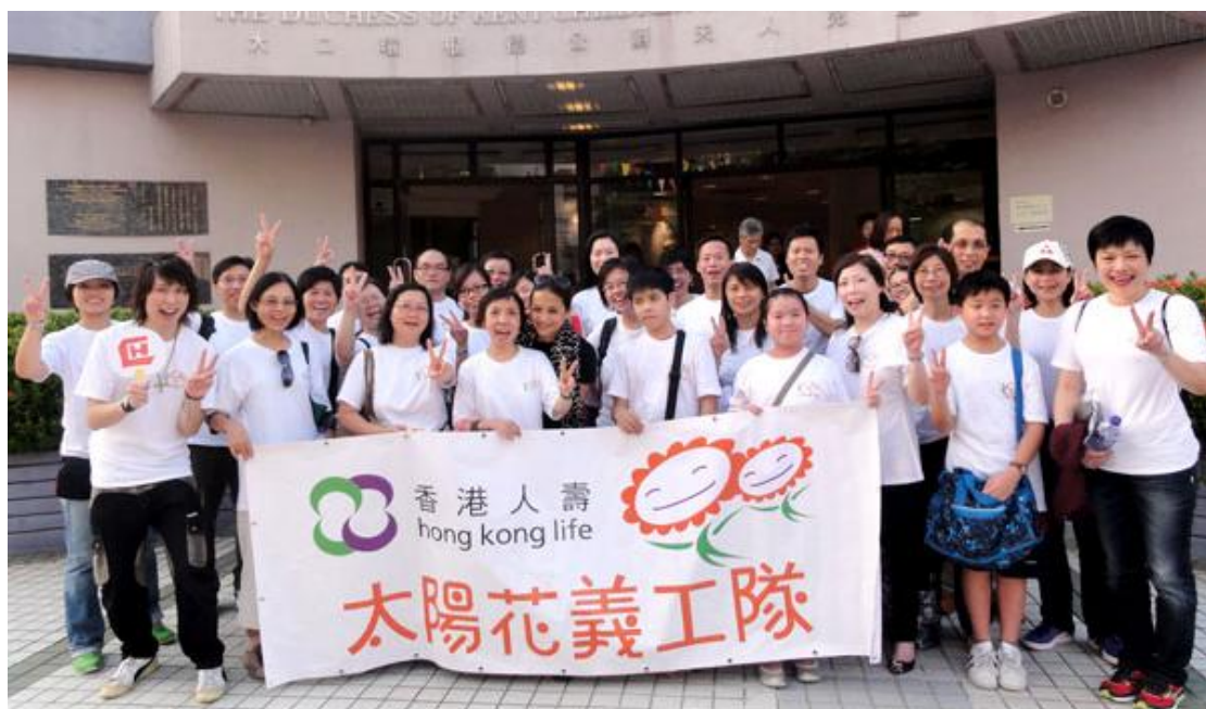
Corporate volunteers took group photo together before leave.